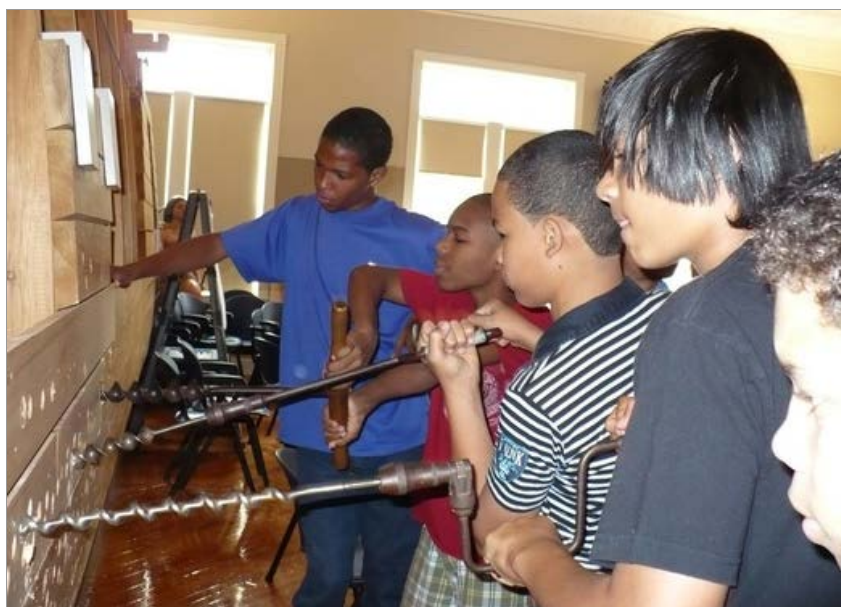
A group of local middle school students learn some of the finer points of shipbuilding.